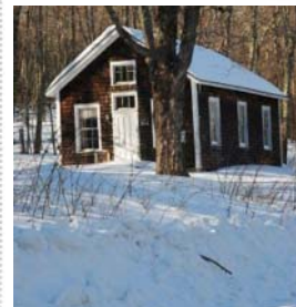
School In Winter

You are welcome to attend monthly board meetings of the MWHS. Meetings are held the second Tuesday of each month at 6 pm at the Town Hall. Come see, come learn and come help.