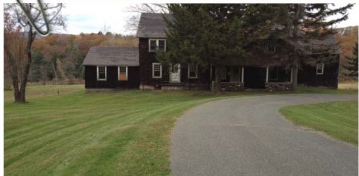
DCR Headquarters, East Street, Beyond Restoration, Beyond Redemption