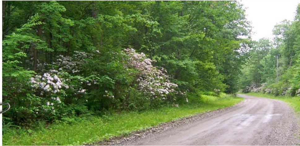
Salisbury Road, Mt Washington