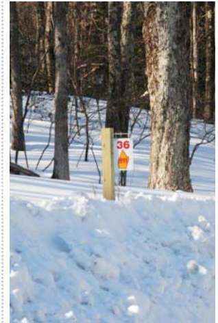
36 West Street , Eliz Kasevich